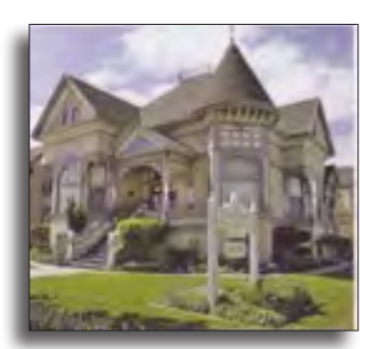
The Steinbeck House

ach year PTCC takes a competitive field trip to a unique local venue where members compete in assigned image categories. This year we're heading into historic Old Town Salinas. The categories for this competition are still in the works as of this writing, but will focus on the strong historic, cultural and architectural elements of Old Town. A full event fact sheet and category list will be provided to Club members and all images submitted for this competition must have been taken on the day of the trip, Sunday, January 22, 2017. We're working on where to meet for lunch, too, so look for more info coming to your mailbox. This is a "Rain or Shine" event!